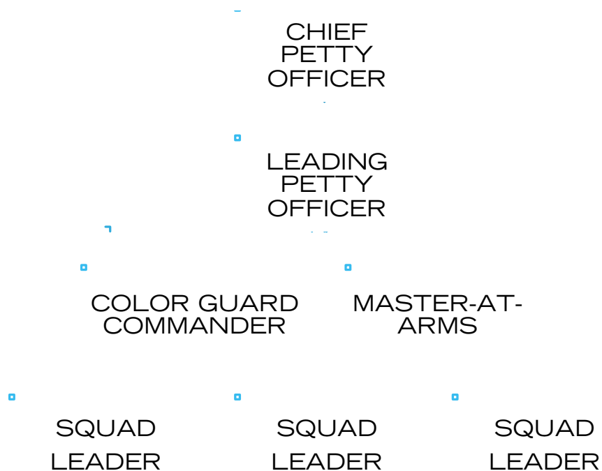
Figure 1: Typical Cadet Chain of Command Diagram

The following figure illustrates an example of a chain of command within a unit that includes the cadet ranks. Not all units have the same chain of command structure, so the cadet chain of command for the local unit may be quite different from this example.